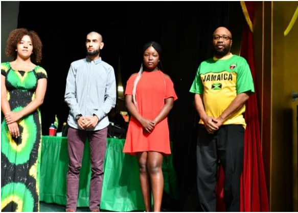
Some of the 2019 scholarship recipients being recognized at our Independence Civic ceremony

The JCAA awarded nine (9) scholarships during the year to support persons pursuing tertiary education. The recipients of scholarships this year were: