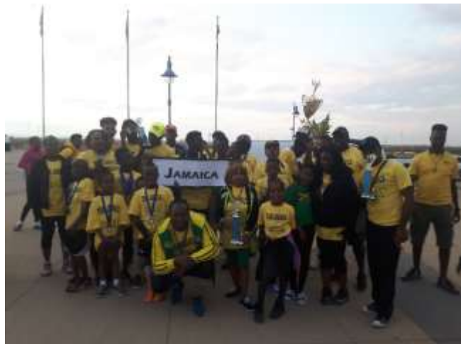
Team Jamaica happily stops for a team picture after capturing numerous trophies including the CHSC Spirit Trophy

It was great that the JCAA, ably supported by Natty's Heritage Caribbean Food Warehouse, was able to support our youth in this event.