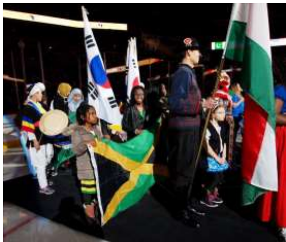
Jamaica was represented at the Calgary Hitmen's multicultural night in February 2017.

The association also participated and extended the benefit of participating in multicultural programs hosted by both the Calgary Hitmen hockey club and the Calgary Stampeders football club. In addition to concessionary ticket prices, members were able to showcase their national pride.