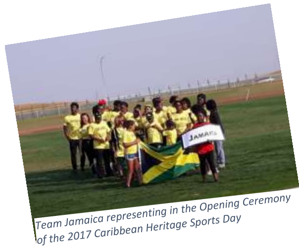
Team Jamaica representing in the Opening Ceremony of the 2017 Caribbean Heritage Sports Day