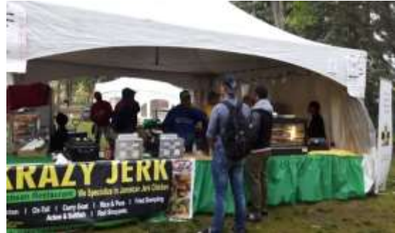
The JCAA partnered with Krazy Jerk restaurant to be part of the Canada Day 2017 celebrations at Princess Island Park.

This year the association issued six (6) scholarships to students attending tertiary institutions. The scholarships recipients this year were: