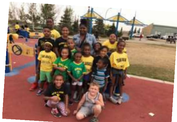
Team Jamaica kids pose for the cameras as part of the Caribbean Heritage Sports Day in September