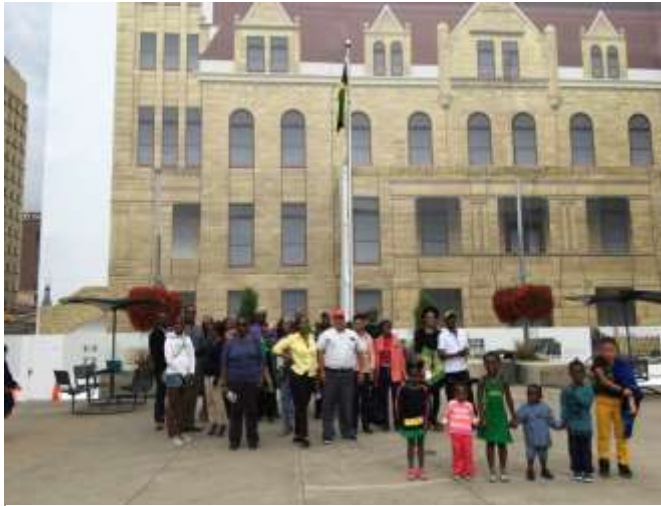
Members of the Jamaican community stop for a moment after the Jamaican flag was raised at City Hall on August 5 th .