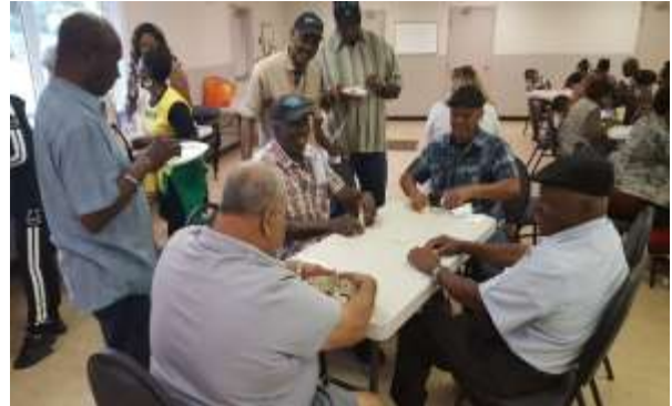
Members enjoying a game of dominoes on Games Night in July 2017. This was one of several themed meetings held during the year.