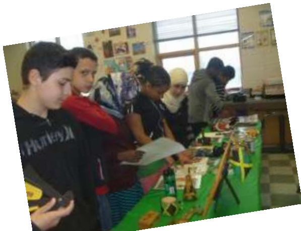
Students at Terry Fox HS learn about Jamaican culture on their Diversity Day