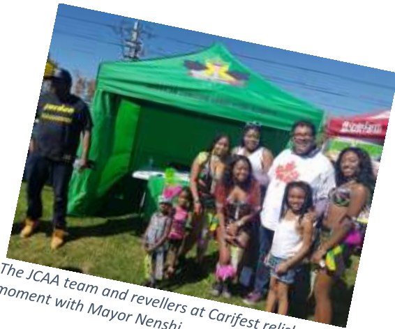
The JCAA team and revellers at Carifest relish a moment with Mayor Nenshi