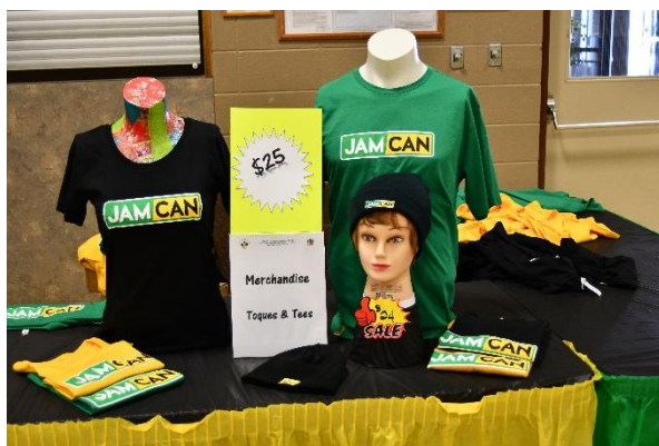
JCAA launched its merchandise line JamCan at Taste of Jamaica. T-shirts and toques were the first products launched.