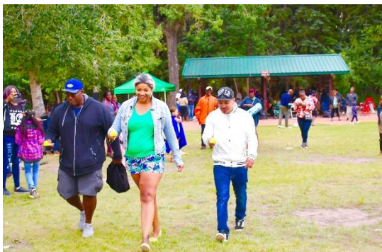
Adults and children had the chance to be competitive while having fun at the Summer BBQ and Volunteer Appreciation