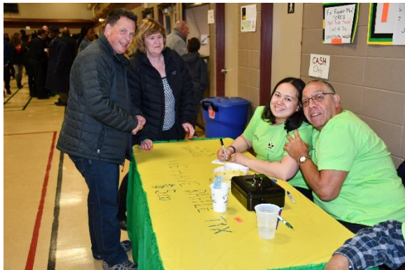
Our committed volunteers ensuring that patrons at Taste of Jamaica enjoyed all that was there on offer.