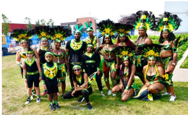
The Jamaican Mas Band participants take time for a team shot after the Carifest Parade 2018.

The JCAA entered the Carifest Parade this year. This was the first time in many years. It was a fun experience to have our costumes, our music and vibes as part of this Caribbean showcase. Plans are already in place to make it an even bigger representation for next year's parade.