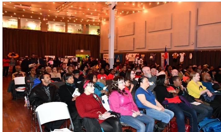
Part of the audience at the Caribbean Black History Month celebrations in February 2018. There were displays, performances and presentations by different Caribbean associations to showcase our culture.