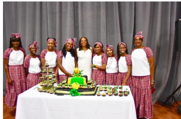
Our volunteers at our Independence Civic Ceremony dressed in the Jamaican national costume surround the ceremonial cake done by Hudson's Spirit Cakes