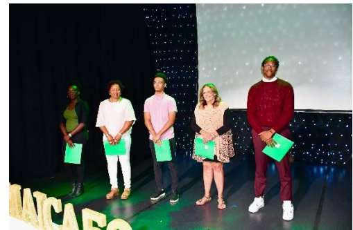
JCAA scholarship recipients being recognized at our Independence Civic Ceremony in August 2018.

Our commitment to those furthering their education remains a key part of our support for our community.