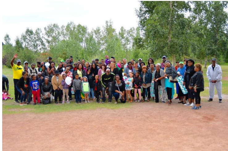
Time for a group picture at our Summer BBQ and Volunteer Appreciation event.

Four (4) new business partners were added this year while two from last year did not continue with the program. This program is great however members must take advantage of the discounts and services for them to be sustained and deliver the desired outcomes.