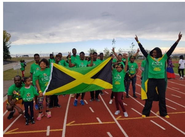
Team Jamaica showing their energy and excitement as part of the parade of athletes at CHSC Sports Day 2018

In addition to the winning the categories above, Team Jamaica was represented in many other sports. Our goal to provide an avenue for Jamaican and other youth to participate with pride and excellence in the Caribbean Sports Day was achieved and well received.