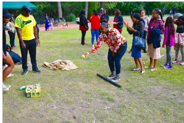
Everyone had a chance to participate in games and the fun at the Summer BBQ and Volunteer Appreciation