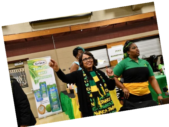
Jamaicans in their colors enjoying the activities at Taste of Jamaica 2018