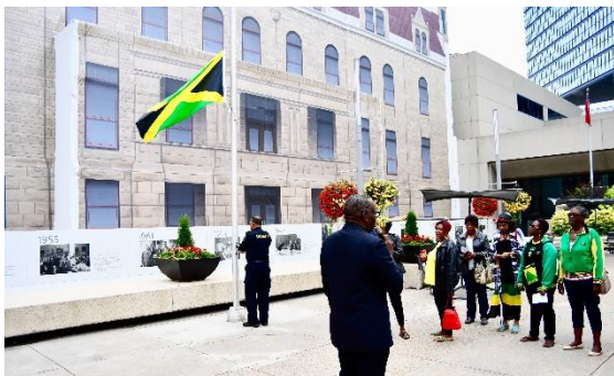
Jamaicans celebrating the raising of the Jamaican flag at City Hall on August 6. Our flag flew at City Hall for the entire day.